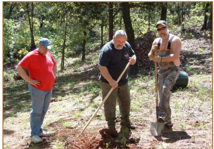
Some Hairy Potters — Getting Started at the Landsite

Come to the Cockpit for some good ol' bear brotherhood in a new location!